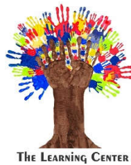
THE LEARNING CENTER

Thirty-four years ago this month I began working in childcare. It was the week of the tragic Challenger explosion to put that in perspective. What an incredible journey I have had in this amazing field. The Learning Center is the sixth center that I have been responsible for managing. Each program earned national accreditation (which I plan to accomplish here as well.) I have worked with hundreds of people and encouraged them all to seek more education. Some of those folks are now serve as an executive director, teachers in the public schools, or as owners of their programs. Many have kept in touch over the years. As I reflect on this professional anniversary, I am proud of the journey and grateful to serve with this delightful church family. Albert Einstein said, "Learn from yesterday, live for today, hope for tomorrow." The children are indeed our future.