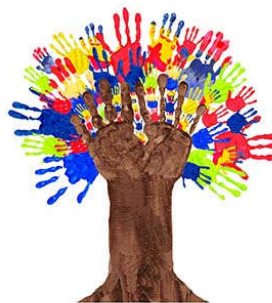
THE LEARNING CENTER